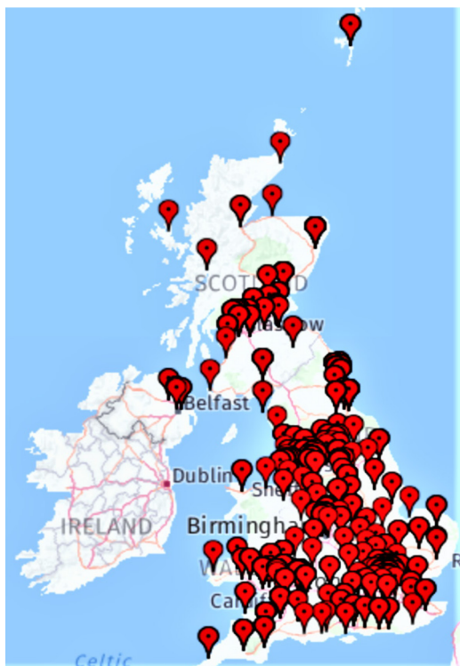
Figure 1. Geographical spread of UK hospitals who have accessed the SNAP page of TOXBASE between the 15 th of April and the 31 st of December 2020

It is important to note that the number of accesses to the TOXBASE site is a significant underestimation of the true number of times the regimen has been used to treat a patient. Many hospitals produce hard copies of protocols for their staff to refer to and, once healthcare professionals have become accustomed to using the regimen, they may not need to log into the database each time they use it. For example, the Royal Infirmary of Edinburgh has accessed the SNAP page on TOXBASE only 3 times since it became live, but has used the regimen to treat all 412 paracetamol overdoses seen in that time [5.3e].